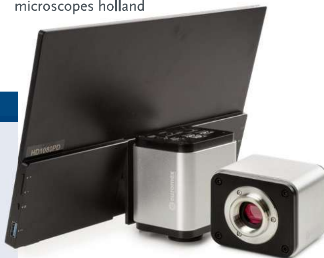
● VC.3048 / VC.3048-HDS